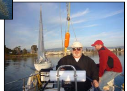
Rescue of the Santana 22