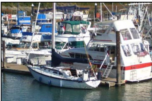
Freedom Won aground at Ballena Bay

Wording on Island Yacht Club Certificate of Circumnavigation: “In recognition of the valiant effort and intrepid spirit required to forge onward to complete the circumnavigation of the tiny island kingdom of Alameda through thick early morning fog and shallow waters on New's Day in the Year Two Thousand Eight, the Morning After the Night Before.”