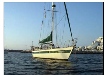
Sensei in her element in Las Hadas

Check the Islander 36 web site's Upcoming Events at www.Islander36.org a few weeks prior to each cruise date for details, further information, and sign ups.