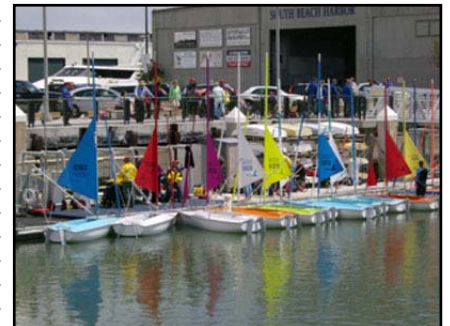
BAADS docks at Pier 40 in San Francisco