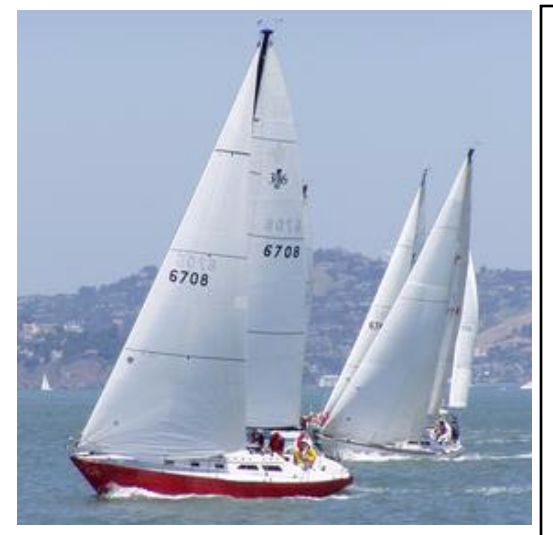
Midnight Sun, City Front May 17

City Front pics courtesy of Pat Salvo from Pacific High