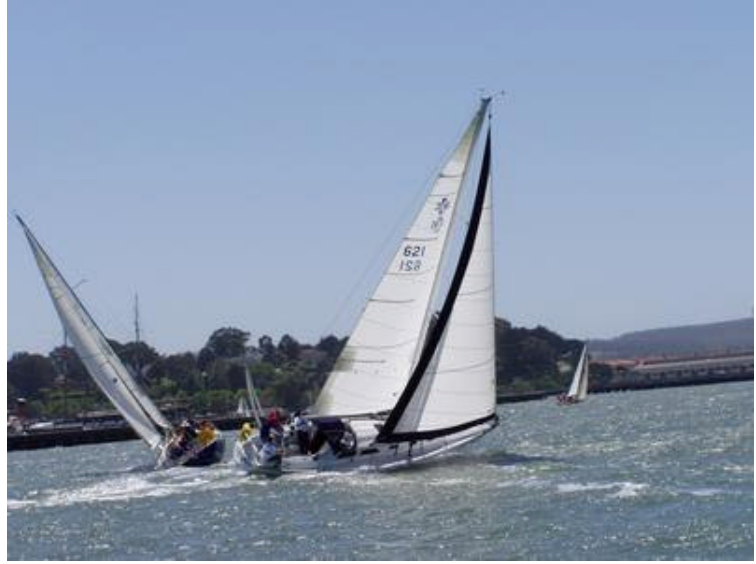
Lean Times, City Front 5/17

<u>June 17th the South Bay</u>. This was the Islander fleet's last race before the summer break. The day