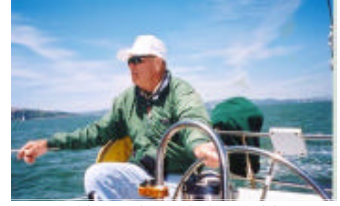
Skipper gives Kindred Spirits an assist at the Helm

First order of the day upon arrival Saturday, after taking the five dogs for a walk, was