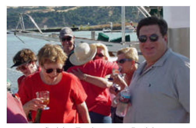
Cruising Fun last year at Benicia

Cruise coordinators get to do the fun stuff: plan the trip details, including meals--onboard or at a restaurant--and act as hosts for the event. experience necessary--all you need is a sense of fun.