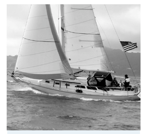
"Lean Times" drives upwind