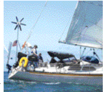
Dream Catcher goes home

Everyone got off fine on Monday morning. They had to motor sail back most of the way because of the lack of wind. Leaving a few hours later may have changed that.