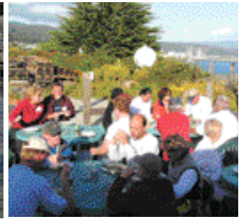
The gang assembles for dinner at the clubhouse

ple have to pay good money at Six Flags for the same thing. Once along the way the GPS recorded 13.7. Not too shabby for a Freeport!