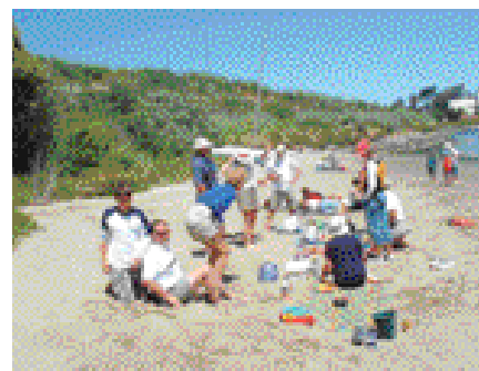
Fun and sun on the sand

by car. Around 18:00 all had come ashore with their goodies and we adjourned to the Treasure Island Yacht Club. TIYC lacks running water, but that was made up for by their gracious hospitality. Flags and pictures decorate their walls, and fresh popcorn encouraged all to patronize the bar. Dennis grilled up a huge plate of hot dogs and the attack on the food began. Hand-made ice cream, cranked mostly by the Nantucket boys and Troy, was served with strawberries to finish off a great meal.