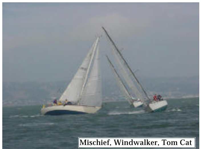
Mischief, Windwalker, Tom Cat